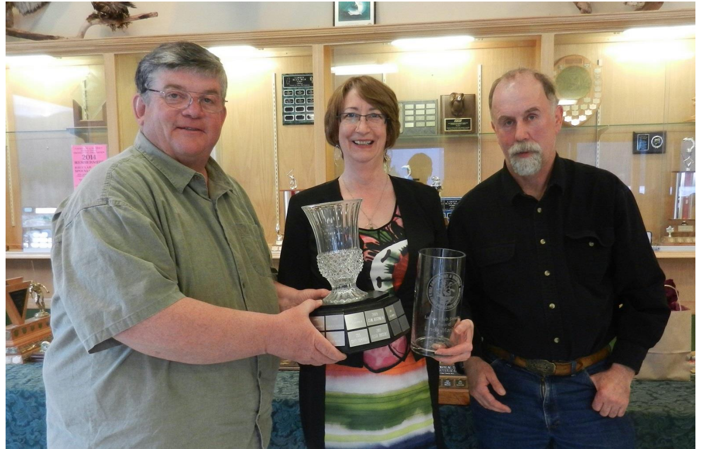
Ladies' Service Award