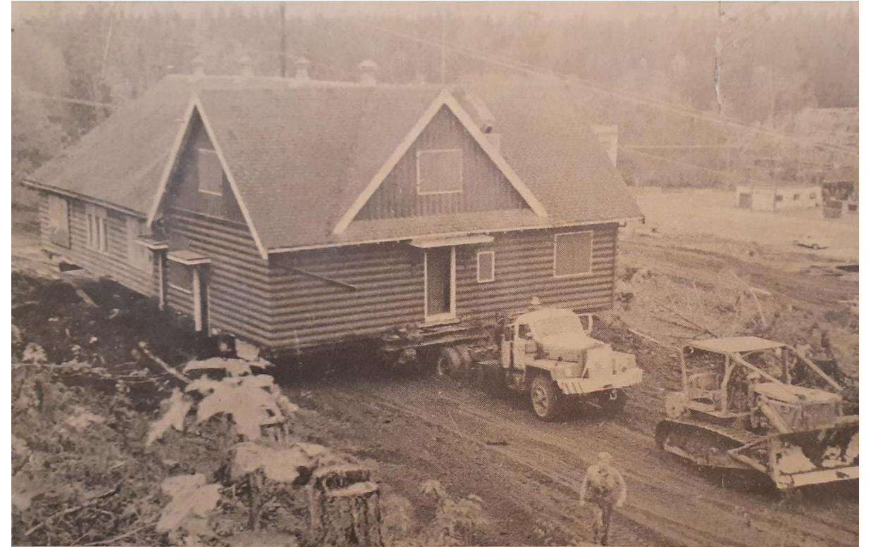
HAVE HOUSE, MUST MOVE — The former fish hatchery building, shown above in its original site, has been moved to land owned by the Courtenay Fish and Game club. The bottom picture shows the building enroute to its new site.